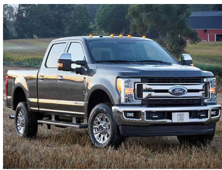
Ford F250 Heavy Duty

But, if you are still hell bent on doing this yourself, let us give you some idea what you are really up against moving a 10' wide tiny house (or a ThinHaus) yourself.