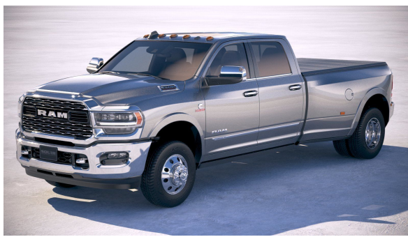
Ram 3500 Dually

You're gonna need a truck. At the very least, you'll want an F250. A better answer is the dual rear wheels of a Ram3500. Do not try this with a gasoline engine. You will burn out the transmission on the first real climb. You will need a diesel engine and Allison transmission ... figure $9,100 extra for that.