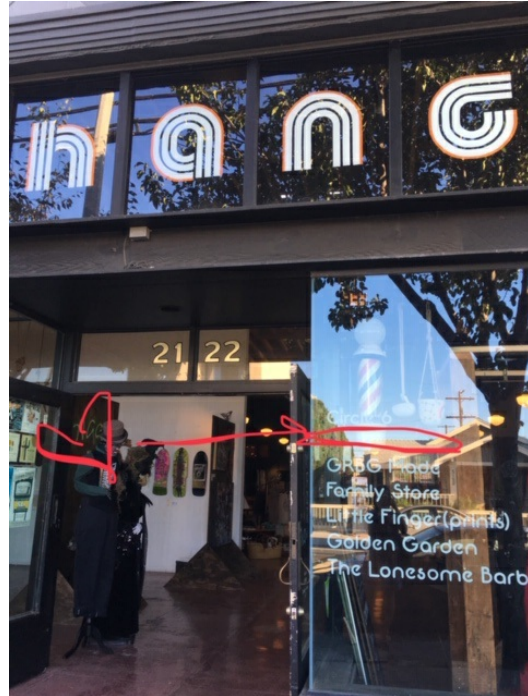
Photot: Geeking out in front of THE HANGOUT on 4th Street in Long Beach where we will open our first brick-and-mortar space in November!

I was all set to spend some family time in Boston a few weeks ago, but before we could fly back East, a little post on Instagram caught my eye. About a certain Retro Row shop collective looking for new vendors. I could have missed it, or hemmed and hawed about responding, or seen it but ignored it, doubting myself and thinking I wasn't ready. But I didn't. I leapt at the opportunity and scheduled a meeting.