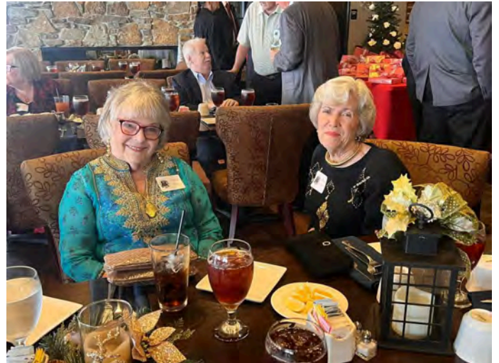
Smiles all around