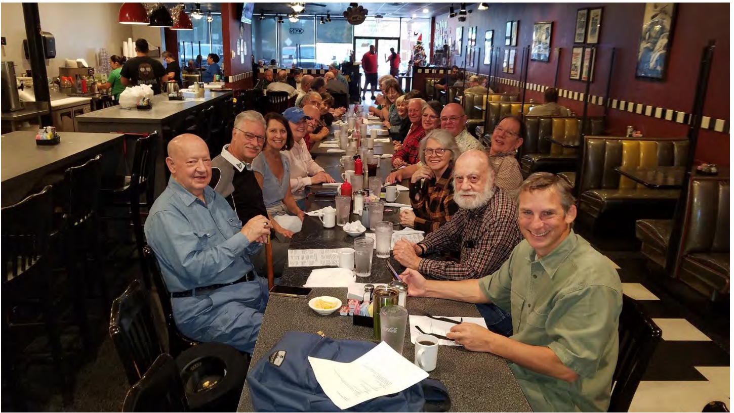
Smiles from both ends of the long table