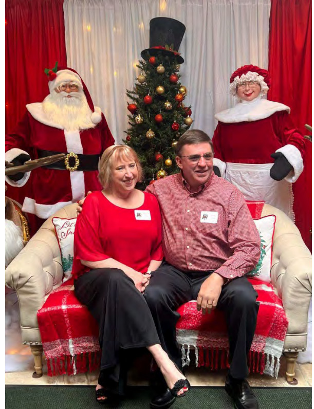
Sitting on Santa's Bench