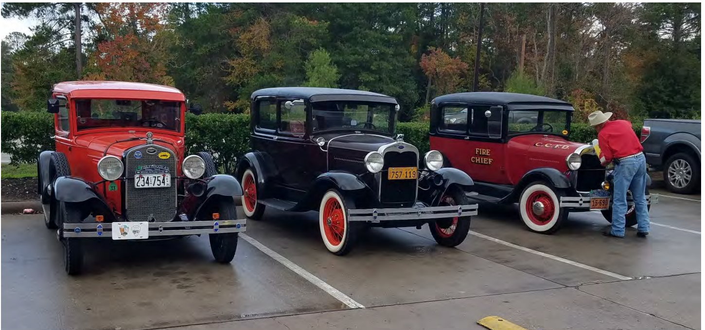
Some of the Model A's that were admired by many