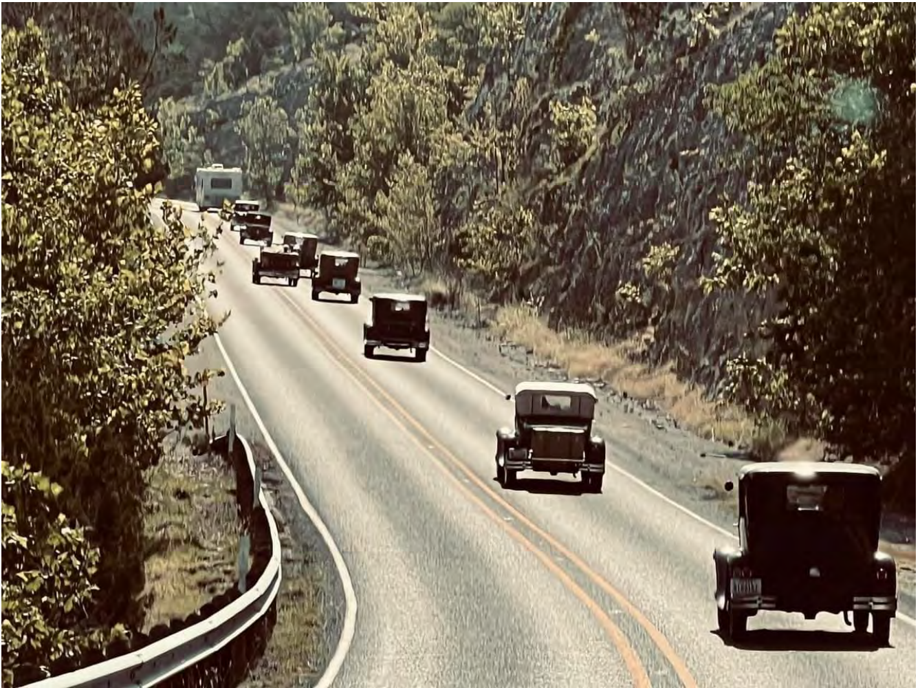
On the road to Bandera