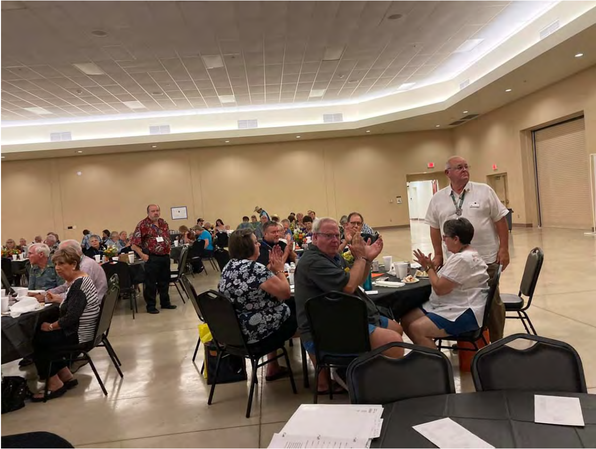
PWA's being acknowledged