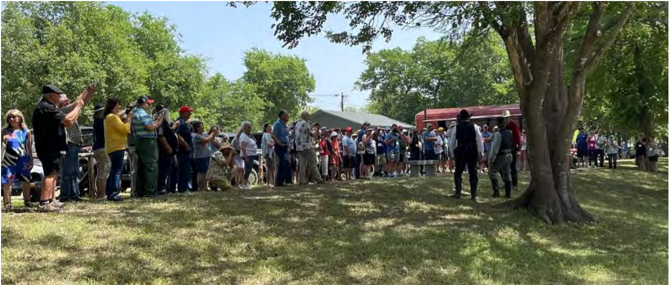
The BBQ was Great