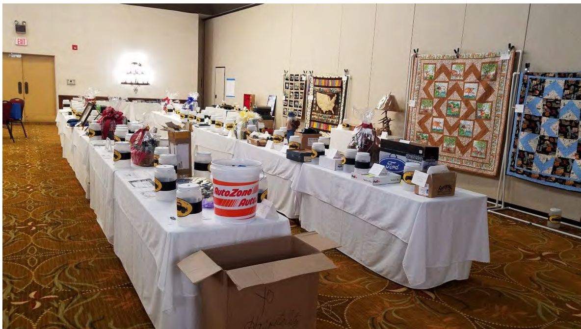
Members of our club assisted the Alamo A's with hosting the Hospitality room

The Piney Wood A's was represented by 14 cars and 26 members. who were active throughout the events from the Hospitality room, Era fashions to car judging Everyone came away with great memories and new friends. During the week, various seminars, car repairs, and Car games were held. Many people made daily drives to the various. wineries surrounding Kerrville and Fredricksburg. Some visited the Alamo and Riverwalk Thursday was the Grand Tour to Bandera (Cowboy Capital of Texas) Along with great BBQ lunch was an old-fashioned shoot-out. Many videos were filmed as well.