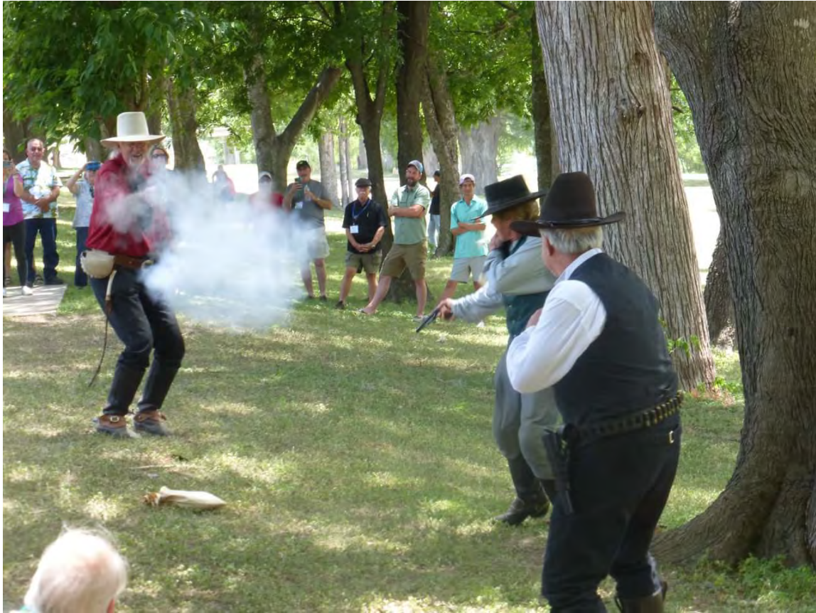
An Old Fashioned Shootout The sounds were loud