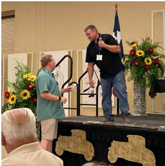
Youngest driver at 24