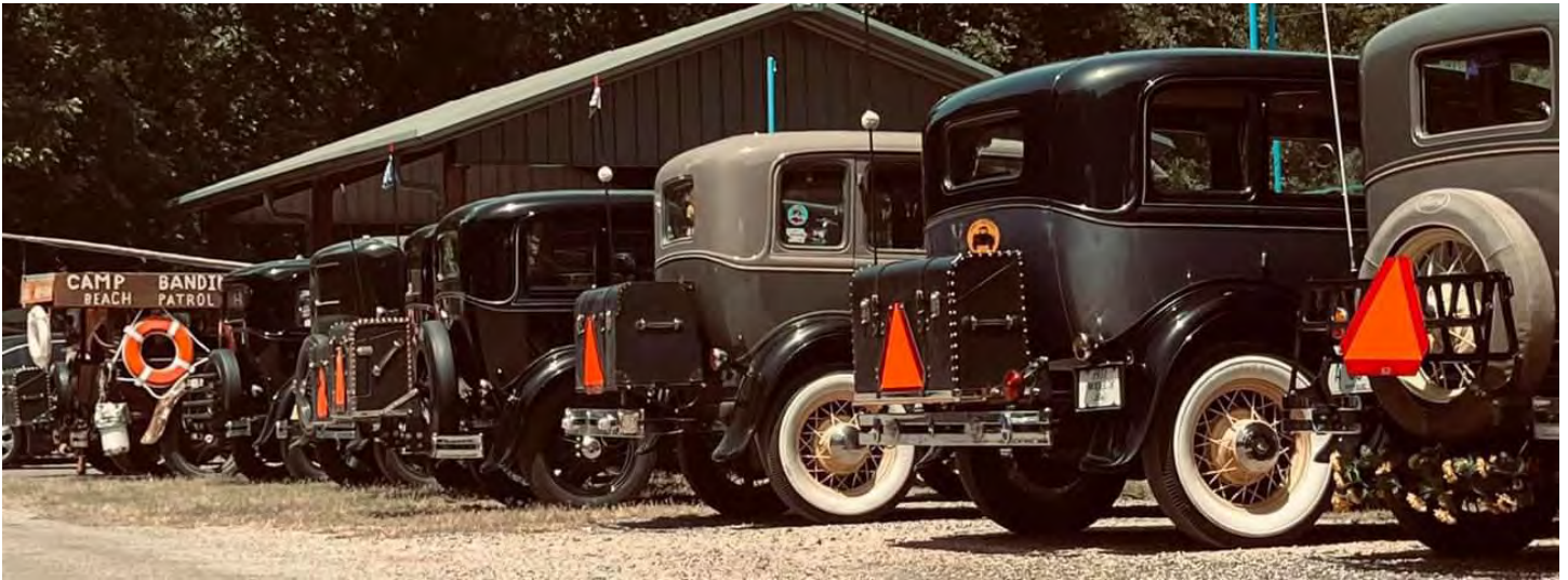
Lined up in the Park