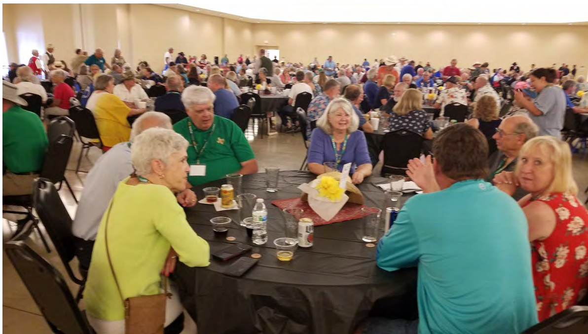
PWA Members at the Welcome Party