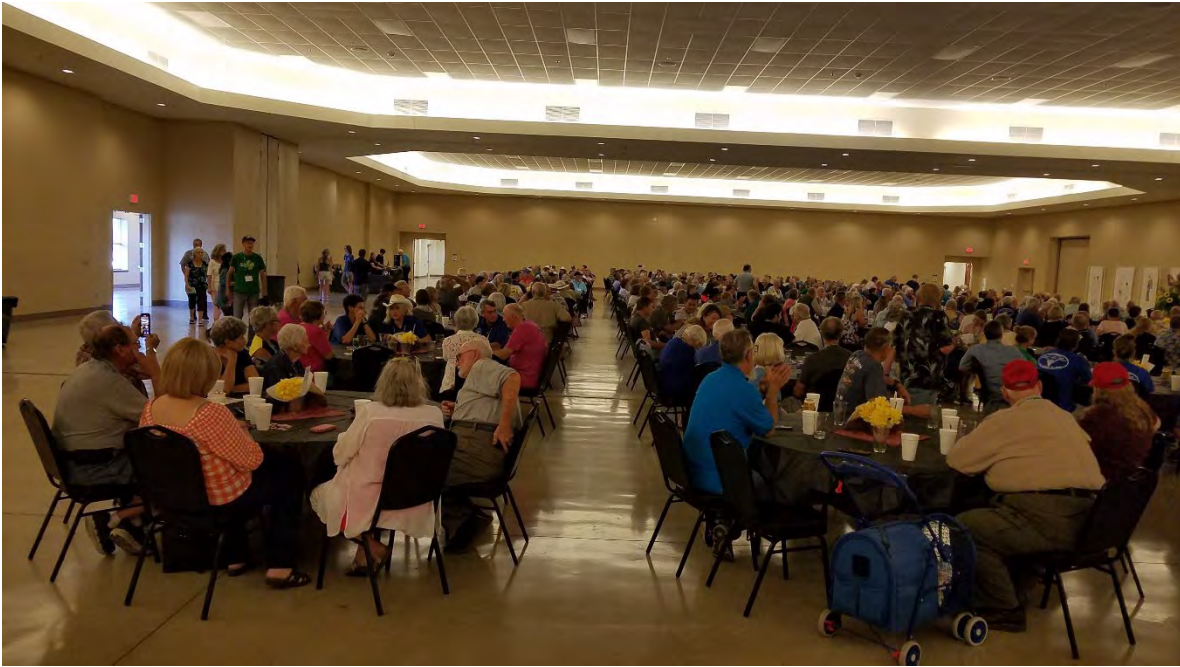
Over 500 people attended the opening night Welcoming party