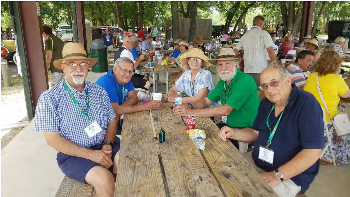
PWA'S Enjoying the moments