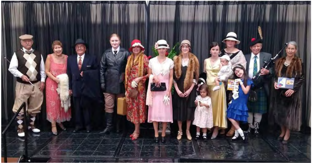
Era Fashions was outstanding