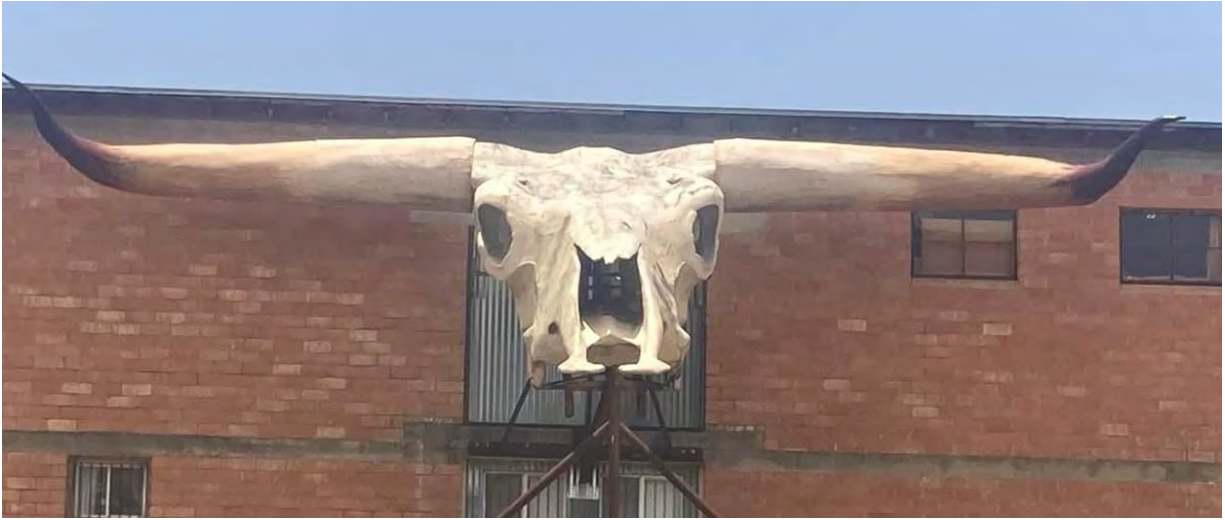
The Grand tour to Bandera (Cowboy Capital of Texas)