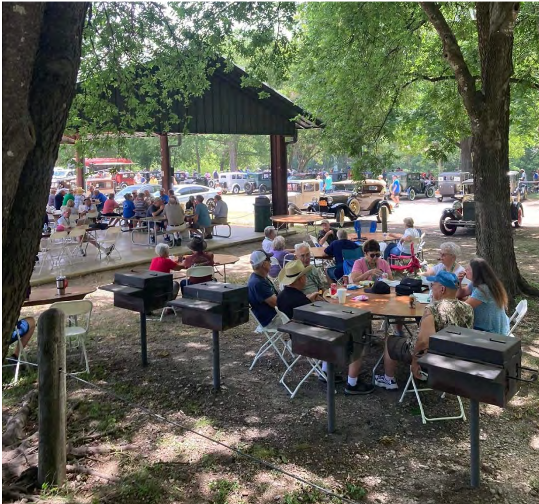
Waiting for the Shootout and BBQ