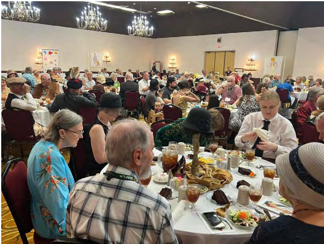
Era Fashion Luncheon was fabulous