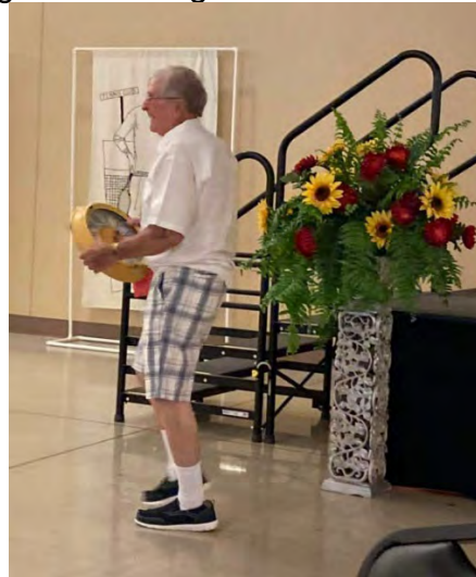
Oldest drivers at 89