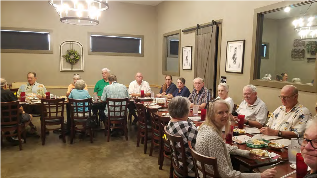
At the end of a great tour, we stopped at Joe's Italian Grill near Hempstead, Texas for an excellent lunch.