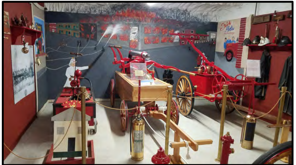
Early 1800's Fire Fighting Equipment