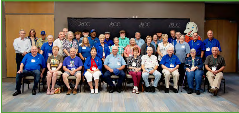
Well attended at the Friday night dinner

The only mishap was mine. After dinner Friday night, not being familiar with the area, I decided to follow a Model A back to the Hotel. Eventually, I realized I was behind someone going home instead of the hotel. Thank goodness for GPS.