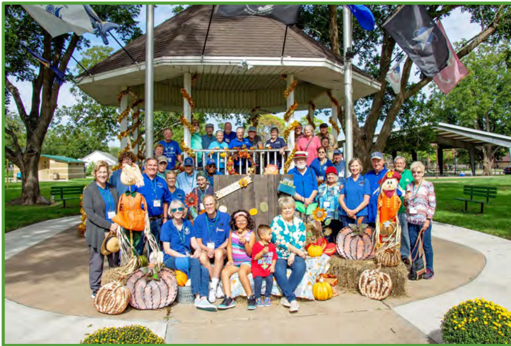
A short stop at Danbury Park