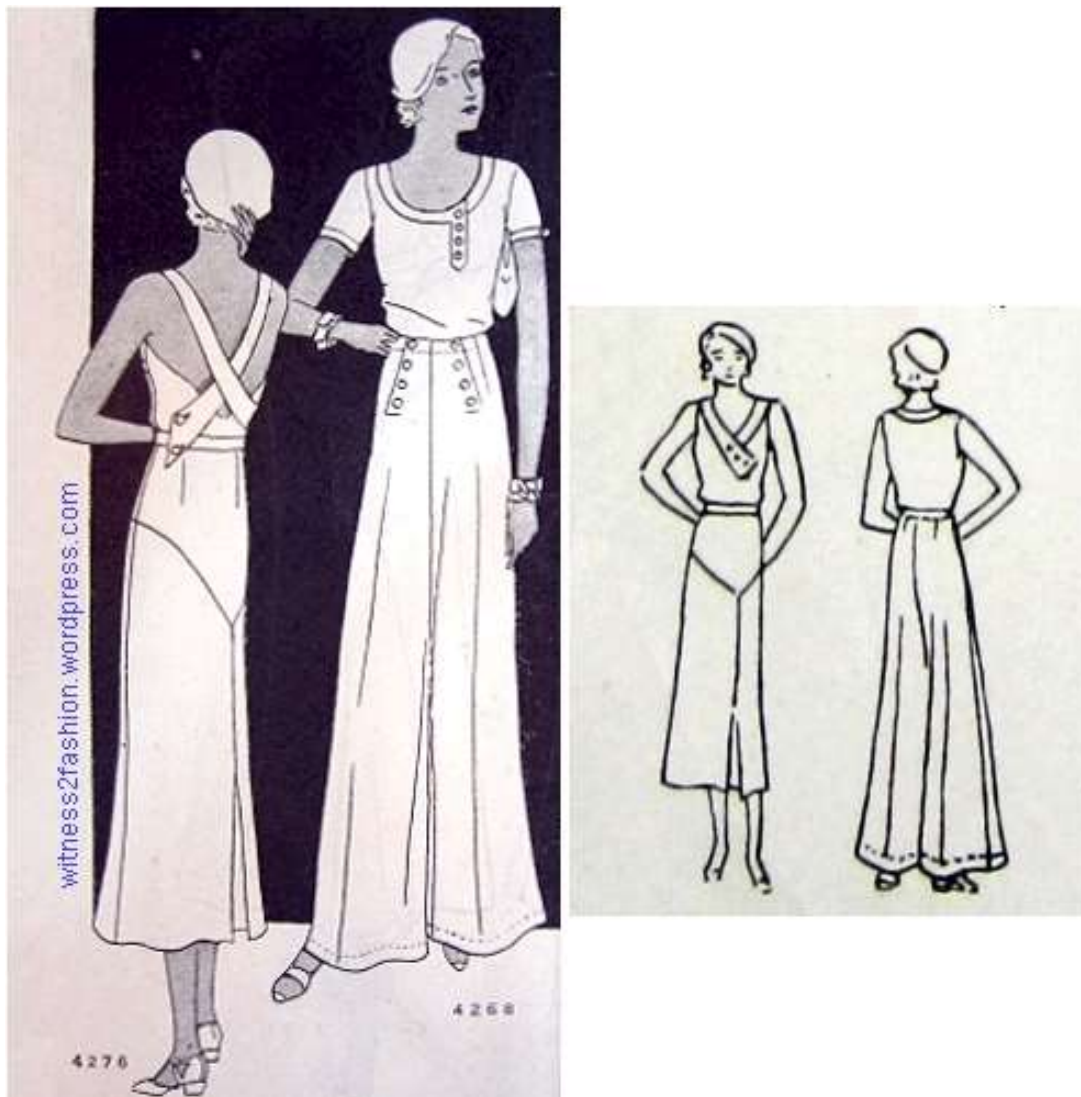
Sports dress No. 4276 and Sailor ‘Pyjamas’ No. 4268. Butterick patterns, Delineator, January 1932, p. 54.

“The newest pyjamas for beachwear ... look more like those of a Breton sailor...” (See cartoon, above.)