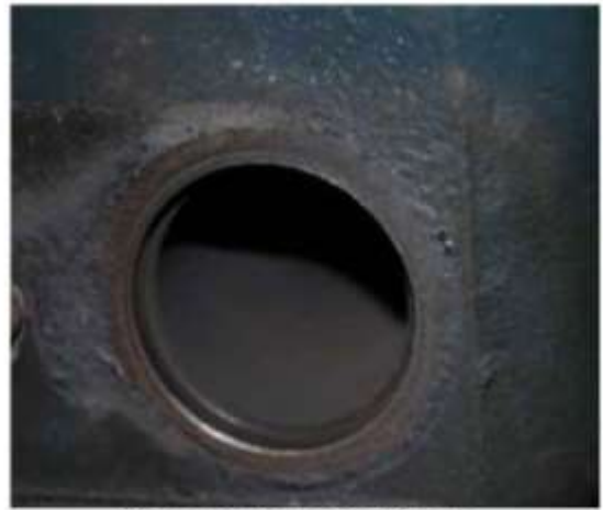
Counter Bore in Block

Below is a new manifold that has been mated with intake manifold and machined flat, note the exhaust openings are in alignment intakes are slightly smaller than exhaust so they do not match but are centered correctly.