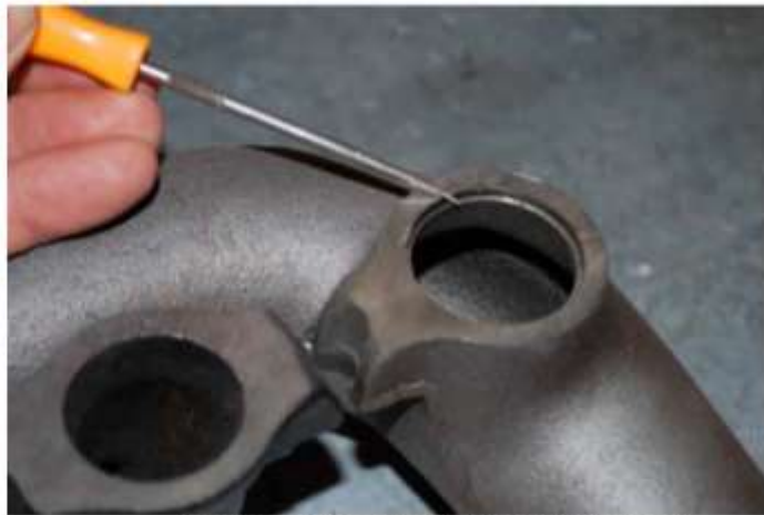
Counter Bore in Exhaust Manifold

In the January 1929 Service Bulletin, a new manifold gasket was introduced that would, "...eliminate the counterbore for the glands in both the manifolds and cylinder block...." This new design was to be installed without glands.