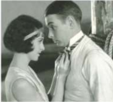
George K. Arthur and Louise Lorraine in Circus Rookies , MGM 1928.