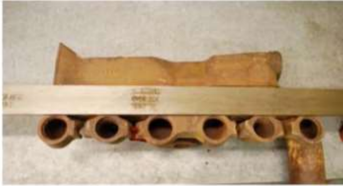
Well-used exhaust manifold heater that shows no sag

Exhaust manifolds with heaters generally did not experience excessive sag because of the additional material helped carry the weight.