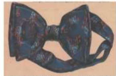
From a Spur Tie advertisement in The Saturday Evening Post 1928

For the Model A gentleman, one did not go out and about in public without a tie around his neck. A bow tie is a necessary accessory for formal wear, and can be a fun addition for casual fashions. However, tying the perfect bow takes practice to get it perfect. Some friends in the Model A hobby happened upon an expert who gave them the following step-by-step process in an effort to help their men "get it right." I thought I would share these steps for the rest of the men out there!