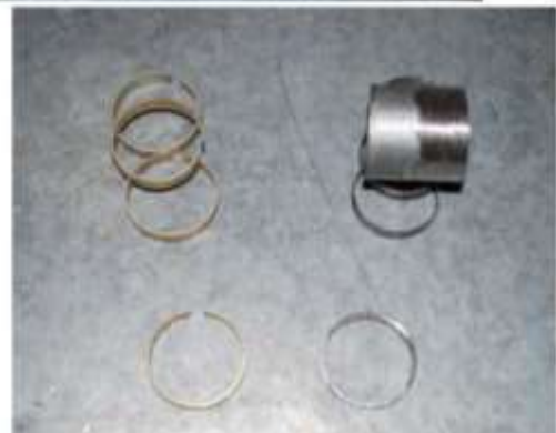
Glands sold by suppliers on left and homemade glands made from conduit on the right

Glands are sold by all the part suppliers and are of the split ring type. These can be pressed into the counter bore by hand. Glands can be fabricated using a piece of 1 1/4" EMT conduit. The EMT is just slightly too large and can be machined or sanded down to fit and cut with a hack saw or band saw.