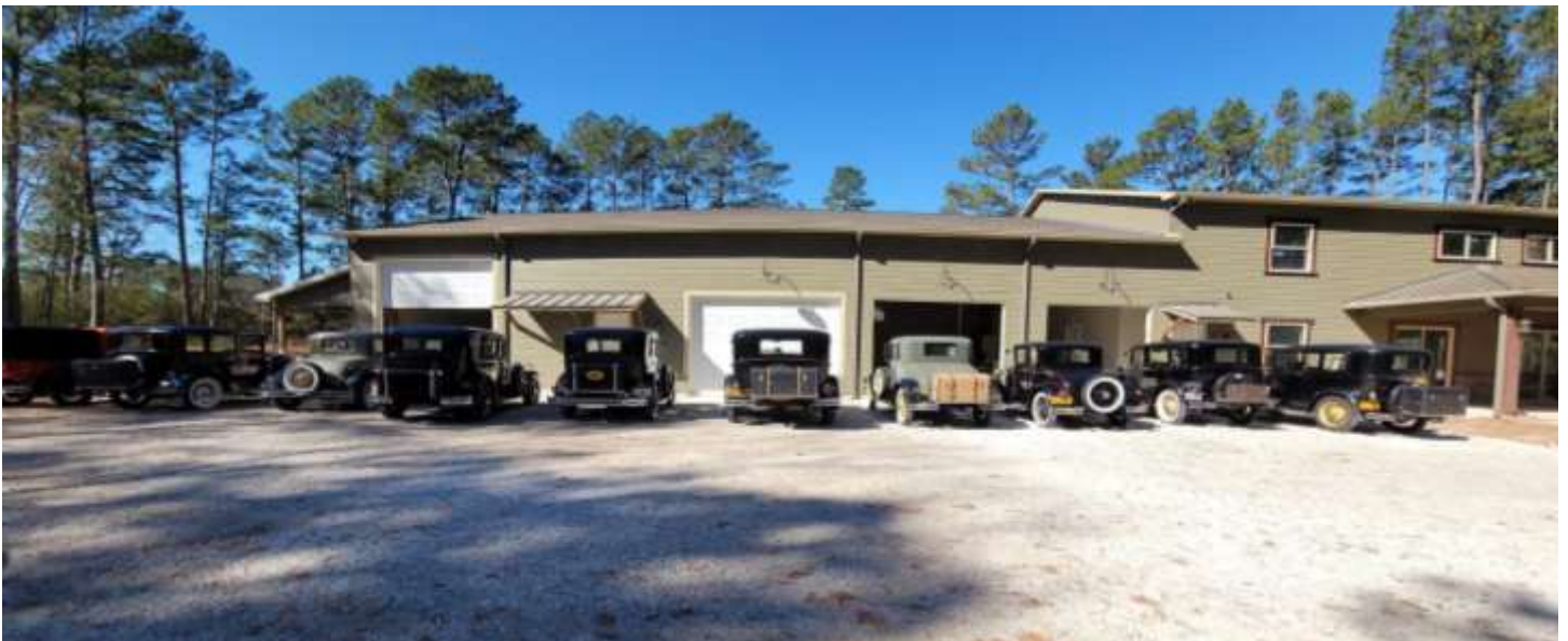
Stopping at the Blaszczak's