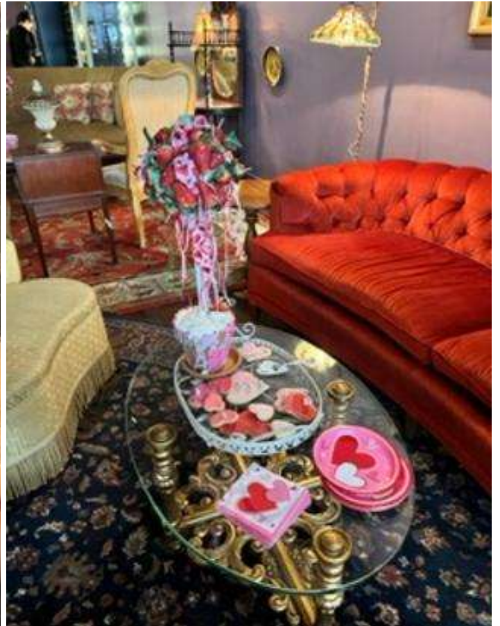
Relaxing at Vino Boheme