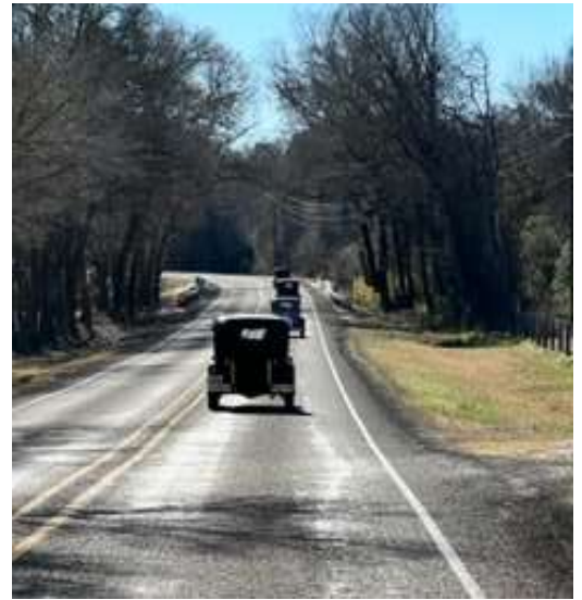
Breakfast at the Village Inn