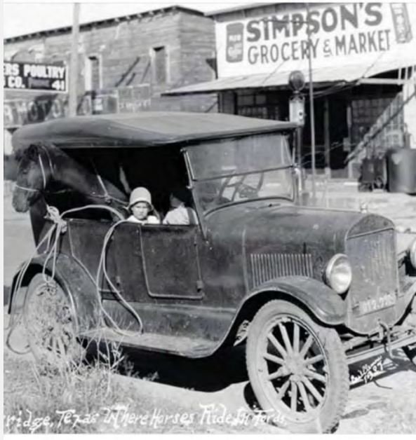
Breckenridge, Texas - where horses ride in Fords. 1930s.