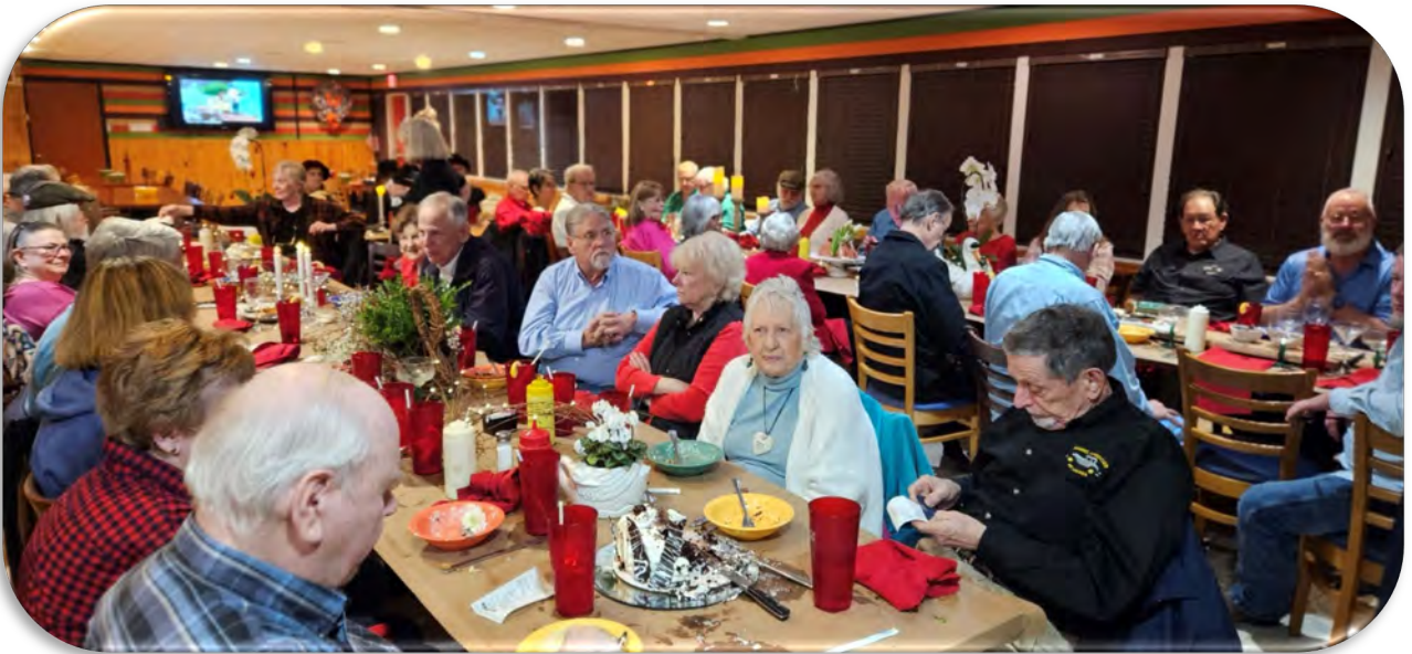
The meals at the Texas Steakhouse were great and of course, followed by the delicious cakes on the table.