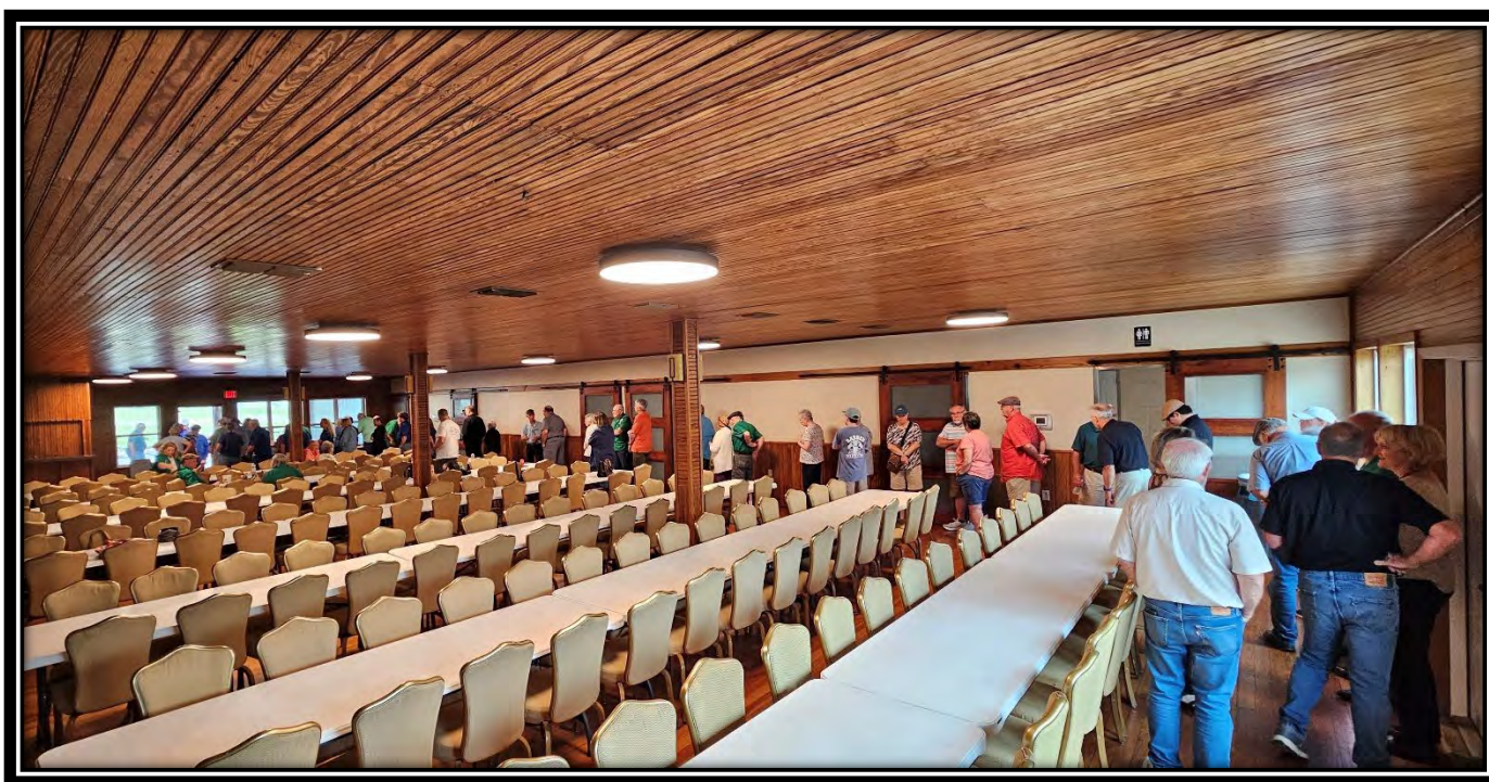
We stopped at lunch in the pavilion at St. Marys church in Praha The AC was a welcome relief from the muggy weather outside.