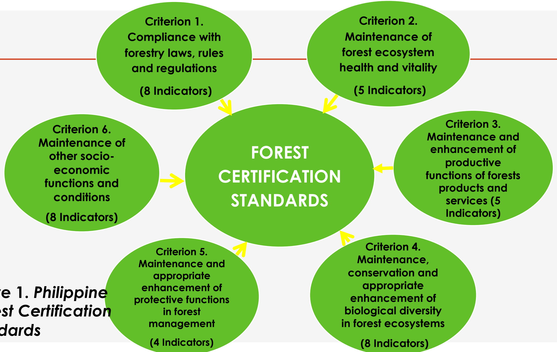
Figure 1. Philippine Forest Certification Standards