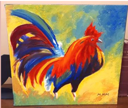
Red Rooster

Hot Lunch Tuesday: Will be continuing this wonderful gesture of kindness in our community. Your helpful support will be greatly appreciated. You may drop off your donations to the office, during office hours. Thank you.