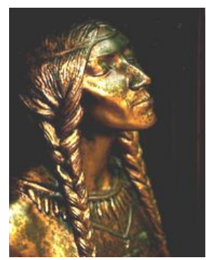
Spirit of Truth