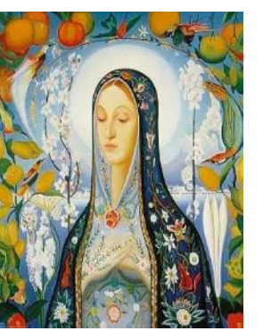
Spirit of Life

"Lord I am not worthy to have you enter under my roof..." Matthew 8:8