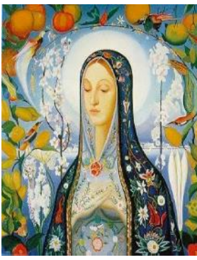
Sprit of Life