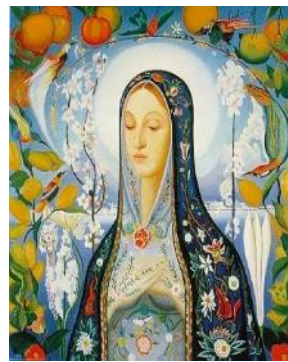
Sprit of Life