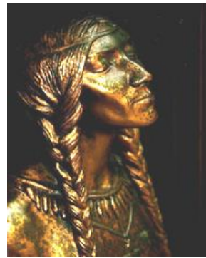
Spirit of Truth