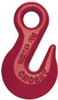
H-323 / A-323 Eye Grab Hook