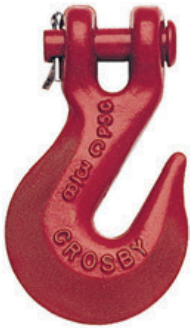
H-330 / A-330 Clevis Grab Hook