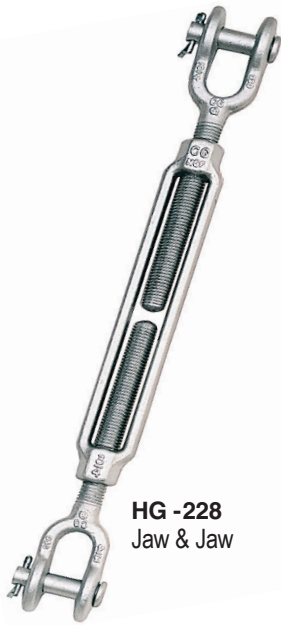
HG -228 Jaw & Jaw

Meets the performance requirements of Federal Specifications FF-T-791b, Type 1 Form 1 - CLASS 7, and ASTM F-1145, except for those provisions required of the contractor. For additional information, see page 452.