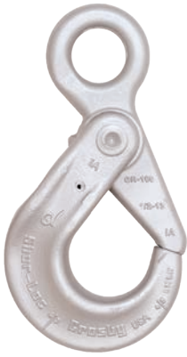
S-1316 Eye Hook