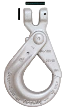
S-1317 Clevis Hook