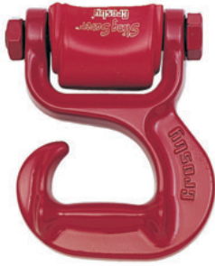
S-287 CHOKER HOOK