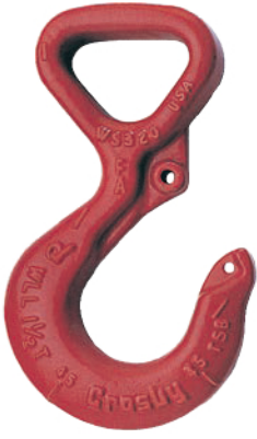
WS-320A SYNTHETIC SLING HOOK