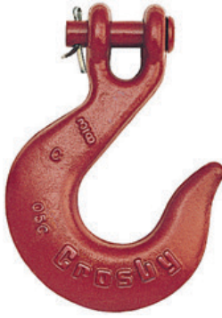
H-331 / A-331 Clevis Slip Hook