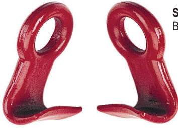
S-377 BARREL HOOKS