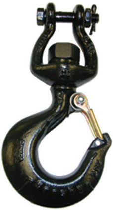
S-3316 REPLACEMENT HOOK

*Ultimate Load is 4 times the Working Load Limit.