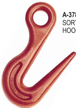
A-378 SORTING HOOK

*Ultimate Load is 5 times the Working Load Limit.