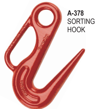
A-378 SORTING HOOK