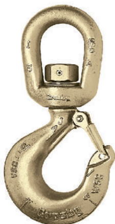
S-322CN / AN (L-322AN Shown)