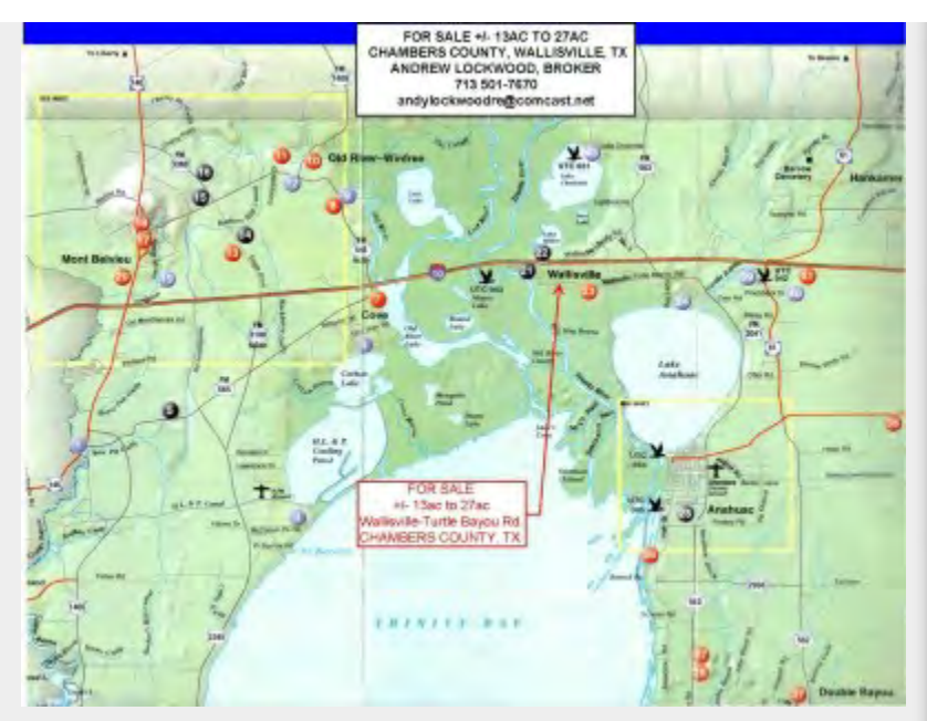
Location Map +/-13 acres to 27 acres Wallisville, TX 77597