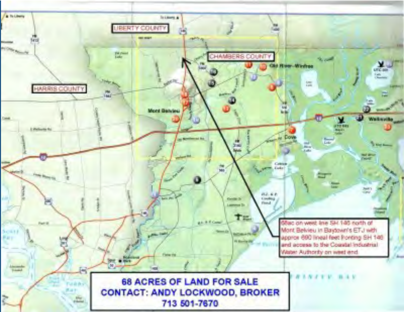
Location Map for 68 acres on SH 146 north of Mont Belvieu, Chambers County, TX