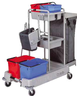
PRODUCT CODE: NADM 2416