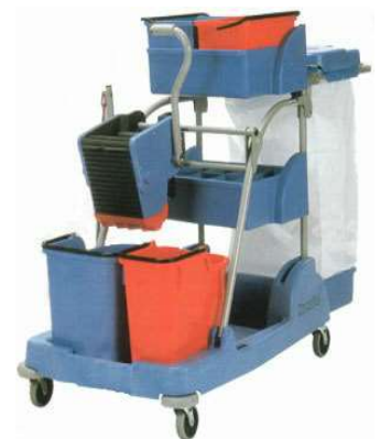
PRODUCT CODE: NANCC-5