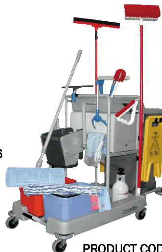
PRODUCT CODE: NANCT-5