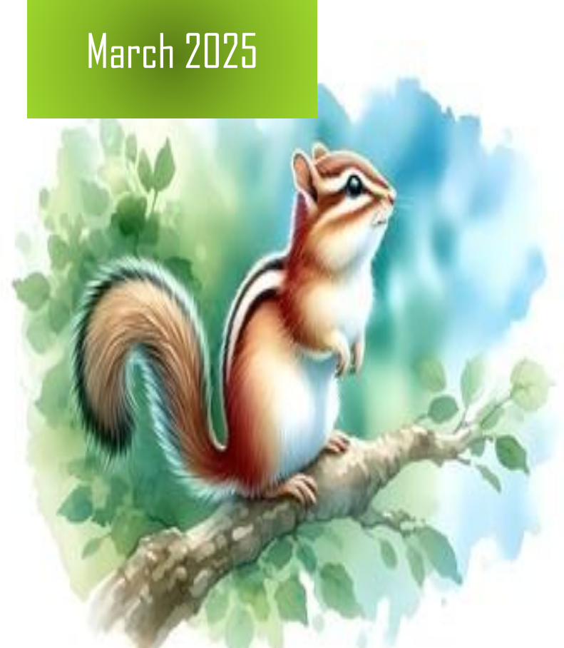
"You don't have to be great to start, but you have to start to be great." - Zig Ziglar