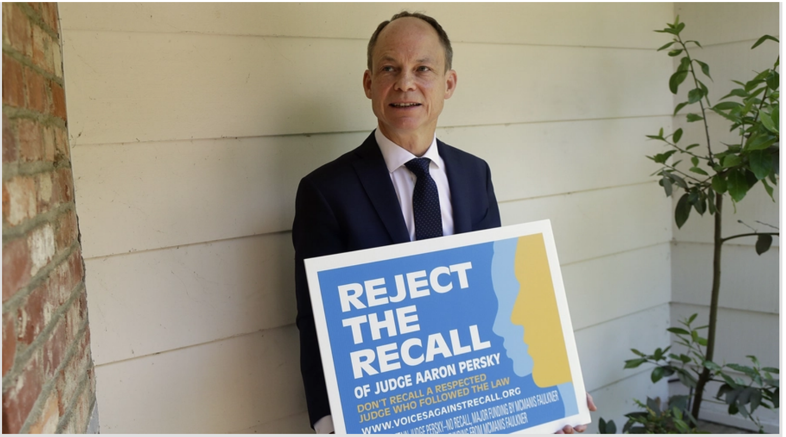
NATIONAL Voters Recall Aaron Persky, Judge Who Sentenced Brock Turner