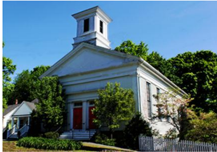
Woodbury United Methodist Church