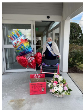
Florence greets the parade