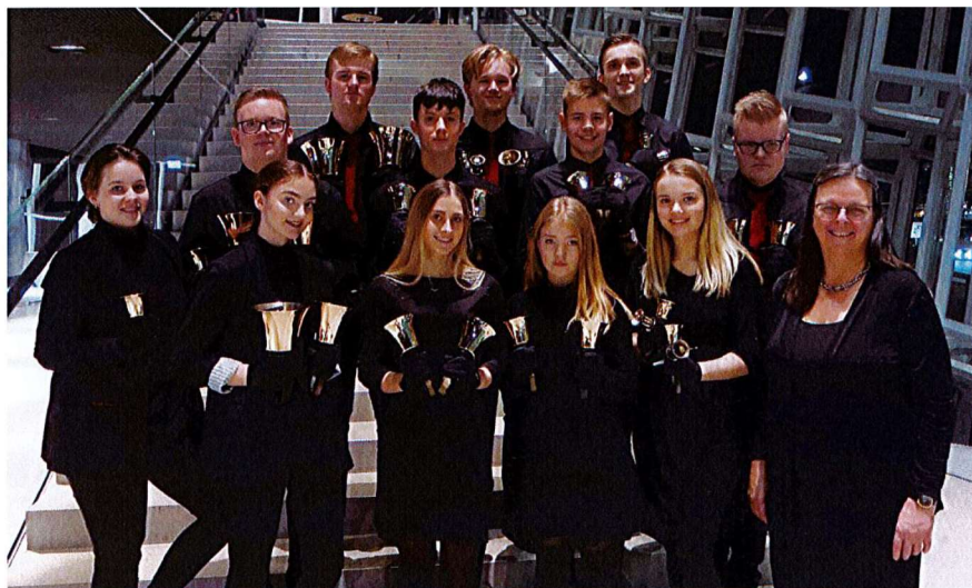
The Reykjanesbaer Music School Handbell Choir from Iceland

In Concert Tuesday, June 25 at 7:00 p.m. at First Church of Bethlehem