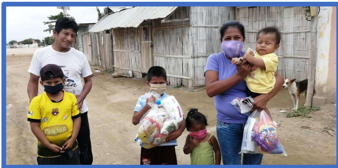
Family Receiving Food - Quevedo

During this crisis, the pastors and leaders of the Methodist Church have been working via virtual media to provide spiritual guidance, Sunday school activities and VBS, health advice and orientation in prevention of diseases, and helping to distribute food supplies and hygiene kits to provide for the physical needs of their communities.