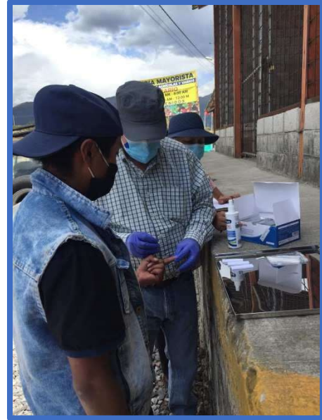
Dakin Testing for Covid