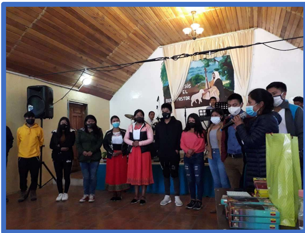
Service for Graduating Youth in Pijal

In Pijal and El Prado and our other children's ministries, full weekly meetings with the children remain suspended. Since October they started to receive small groups of 10 children, accompanying them with their schoolwork and providing spiritual and emotional support. In September, the children started school activities in a virtual mode throughout the country and needs are being felt more. Most children do not have an internet connection at home and must use cell phones to receive instruction, to do this they have to buy prepaid cards for data service. During this time of economic crisis, the cost of materials weighs on families and your support is crucial, thank you for this.