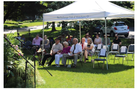
The Dignitary Tent