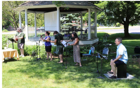
Our Praise Band