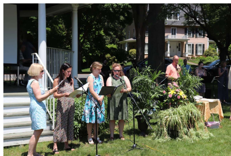
A group of our WUMC singers