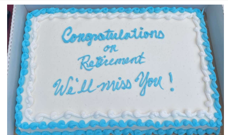
And our love and prayers go with you on your new journey!