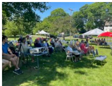
Members of WUMC