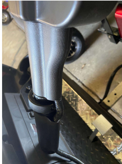
Figure 2.2.2 RX5 Wiring Harness Clips