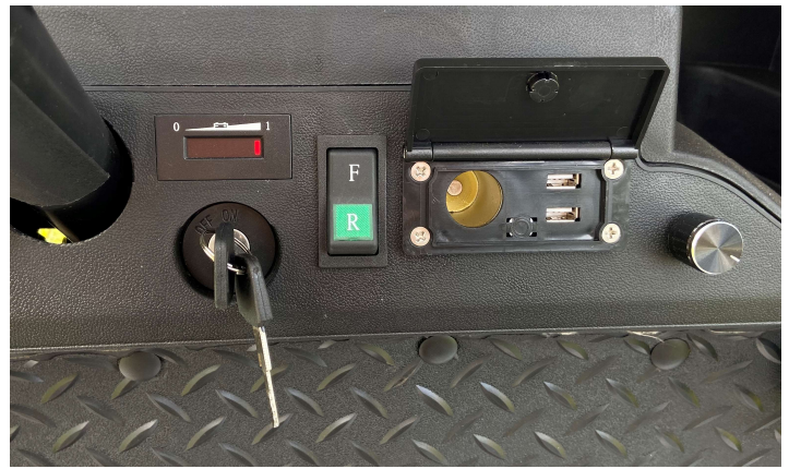
RX5 Dash Panel

Use this knob to adjust the maximum speed of the cart. Turn clockwise for full speed and turn counterclockwise to limit the maximum speed.