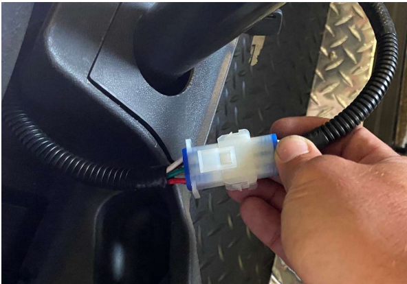
Figure 2.2.1 RX5 Wiring Harness Connector

2.3. Install wiring harness clips on the steering shaft. (Fig 2.2.2)