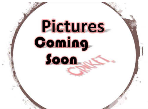
RX5 36v Charger