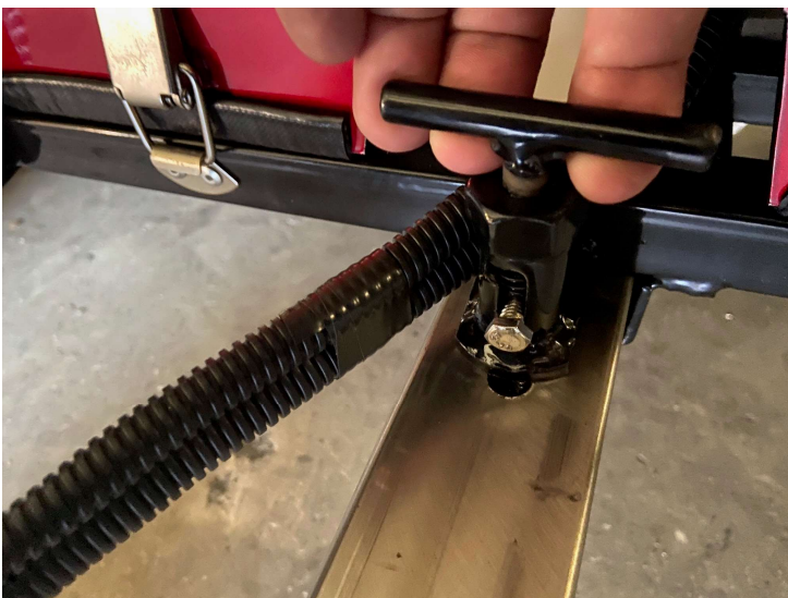
Figure 3.2.2 RX5 T-Lever Locked

3.2. Gently pull or push the vehicle chassis front end forward until it stops. Then lift and turn the T-Lever counterclockwise and lock the chassis into position. You might need to slightly adjust the two chassis once the T-Lever is lowered for it to “click” into lock. Check that the lever is locked. (Fig 3.2.1)