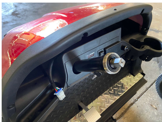
Figure 2.1.1 RX5 Lower Steering Shaft