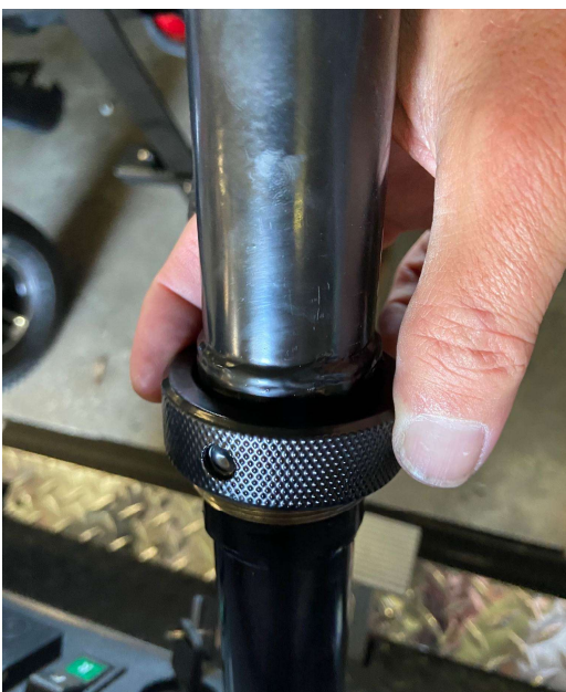
Figure 2.1.2 RX5 Steering Shaft Nut