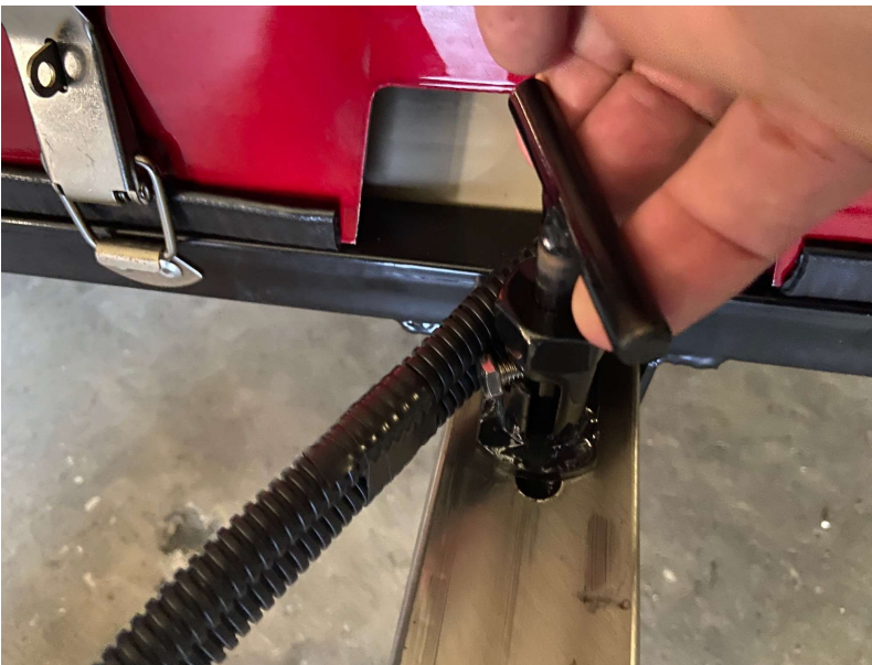
Figure 3.1.1 RX5 T-Lever Released

3.1. Use your hand to pull up on the spring-loaded T-Lever in the center of the permanent floorboard. Turn the lever clockwise until it locks open. (Fig. 3.1.1)