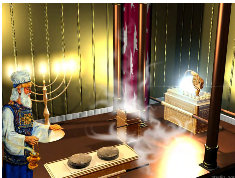
The beautiful garments of the High Priest

Set in the breastplate, one on either side, were two brilliant stones, called the Urim and Thummim. By means of these stones the mind of the Lord could be ascertained by the high priest. When questions were asked, if light encircled the precious stone at the right, the answer was in the affirmative; but if a shadow rested on the stone at the left, the answer was negative.