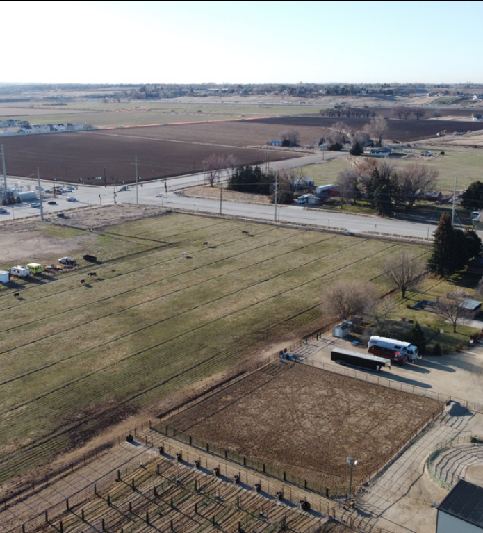
Black Cat & Franklin Intersection - Looking SE from Property