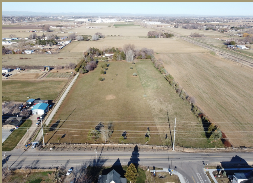
Aerial of Land looking East towards Black Cat Road