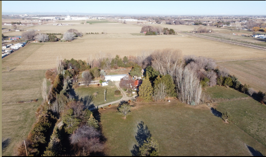
Aerial of Home on the West Side of the 15 Acres