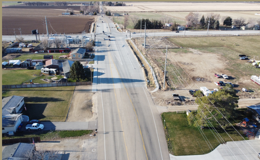
Looking South down Black Cat to the Intersection with Franklin Rd.