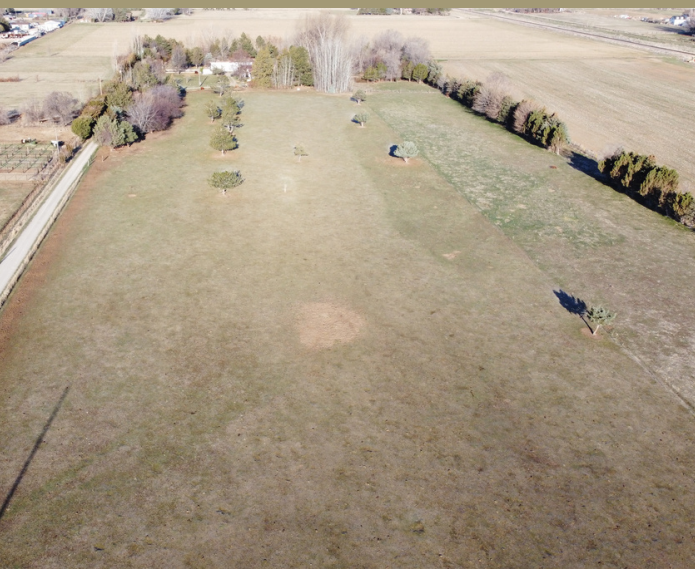
Aerial of 15 Acres looking West from Black Cat Road