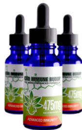
CBD Immune Buddy Wellness Support