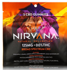
5-Pack CBD Gummies 125mg