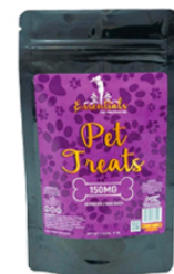
Full Spectrum CBD Pet Treats