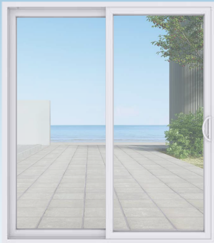
Stainless steel track for easy, smooth operation.