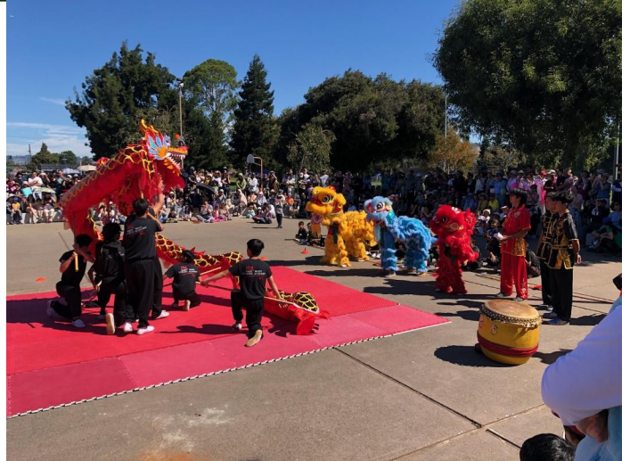
East West Kung Fu Academy Lion & Dragon Dancers will return for the 2025 DITP

A big thank you to the San Leandro Optimist Club and Litvinchuk Realty for their generous financial support to make this event possible. Thank you to all the performance and community groups who are partnering with us to make the day special for all.