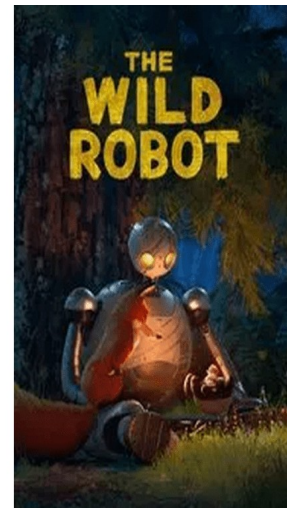
Free Outdoor Movie Night after DITP at 8PM