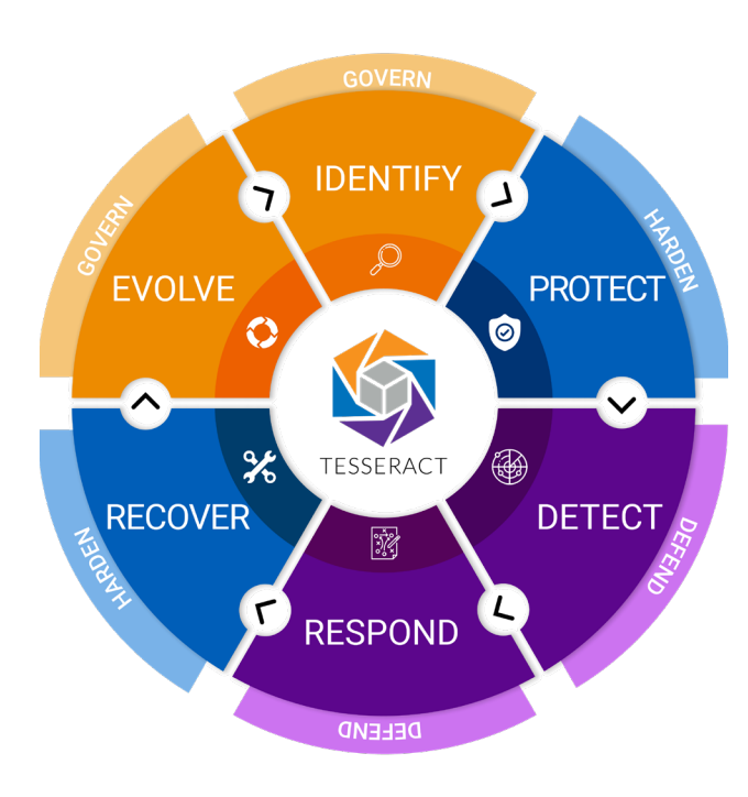
Figure 3. Tesseract Program Wheel