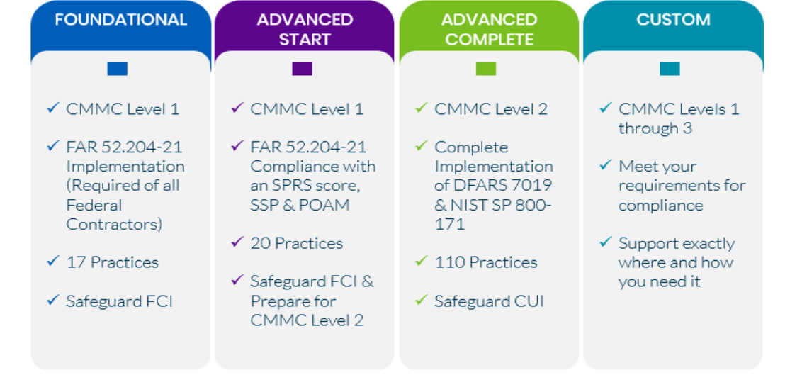
Figure 2. Tesseract Program Levels

POAM to reach Level 2. An SSP and POAM is required to meet DFARS 252.204-7012, which is a current requirement for Defense contractors safeguarding Controlled Unclassified Information (CUI).