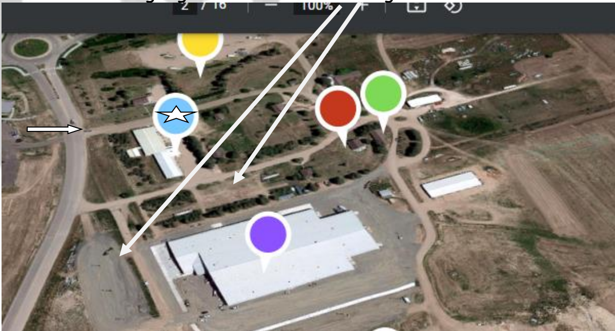
M/K building Light Blue dot and Parking lots

Once you unload, please move your car to one of the parking lots. Please do not park next to the building this is reserved for Handicap parking.