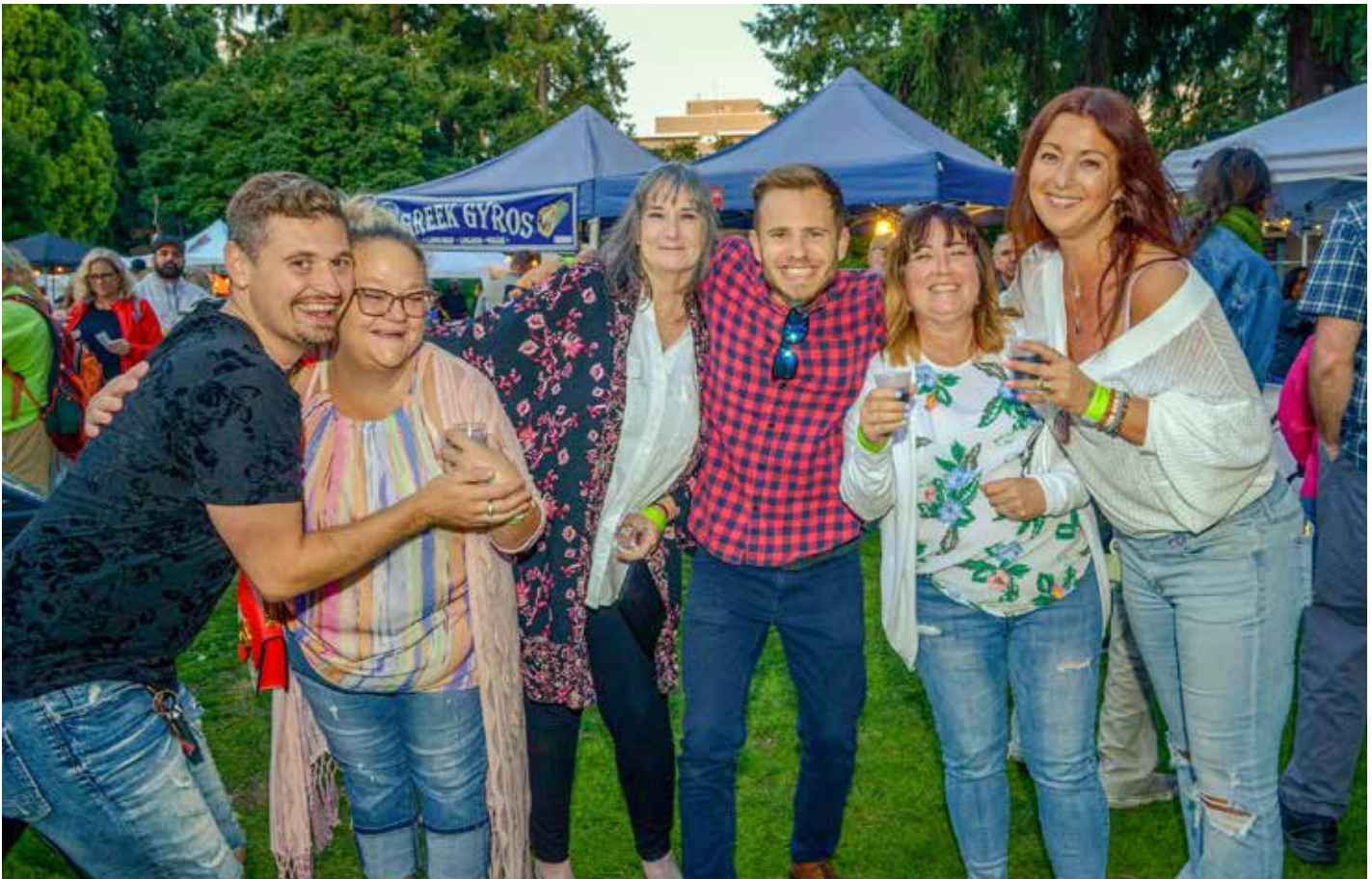
Music, art, wine, friendship & fun. Cheers!