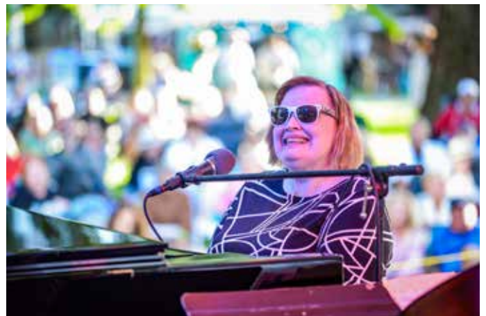
Diane Schuur performing at the Vancouver Wine & Jazz Festival

Take 6 has collaborations and praise from such luminaries as Ray Charles, Stevie Wonder, Brian Wilson, Ella Fitzgerald, and Whitney Houston. Take 6 has crossed most musical genres, from straight-ahead Jazz to Pop to adult R&B, doo wop to blues. Like a fine-tuned vocal orchestra, the group continues to push the boundaries of creativity and musical genius with every new release, and with their ever-evolving live performances. The multi-platinum selling sextet has toured across the globe, and is recognized as the pre-eminent a cappella group in the world.