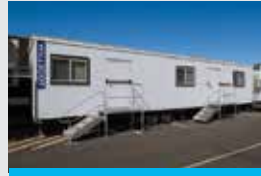
Mobile Offices & Complexes