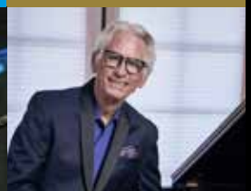
The Rumba Kings