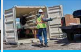
Portable Storage Containers