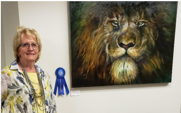
By Phyllis Craig