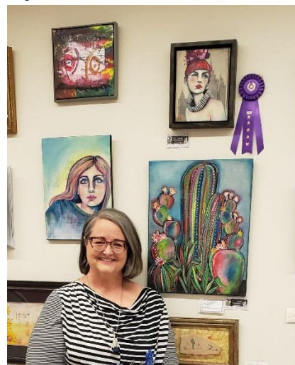
By Tammie Pursley