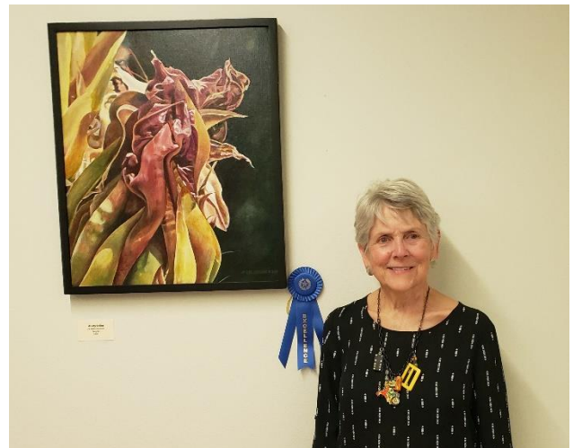
By Jo Ellen Decloure