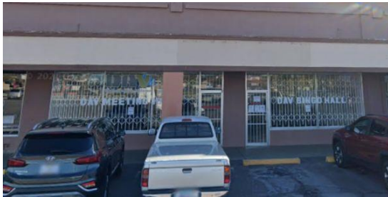
Meets on the 1st Thursday of the Month Disabled American Veterans 1119 E Main. Mesa, AZ 85203 Meets on the 2 nd and 4 th Thursday of the month