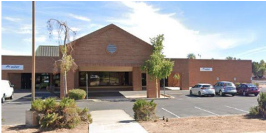
Aster Senior Center at Mesa Downtown 247 N Macdonald, Mesa, AZ 85201