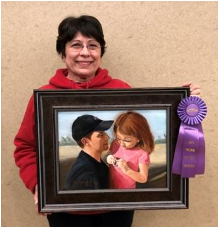
ARTWORK OF THE Month - January "The Wristband" by Elvie Becker – See Bio on Page 4