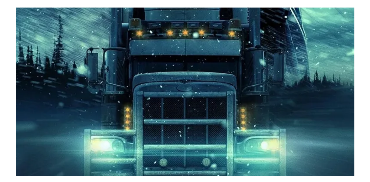
Fri., Aug. 9, 9:30pm @ Arts Court Theatre (2 Daly Ave.)

On a frozen highway in the remote Canadian North, an Indigenous woman and her dog are hunted by a stranger in a semi truck.