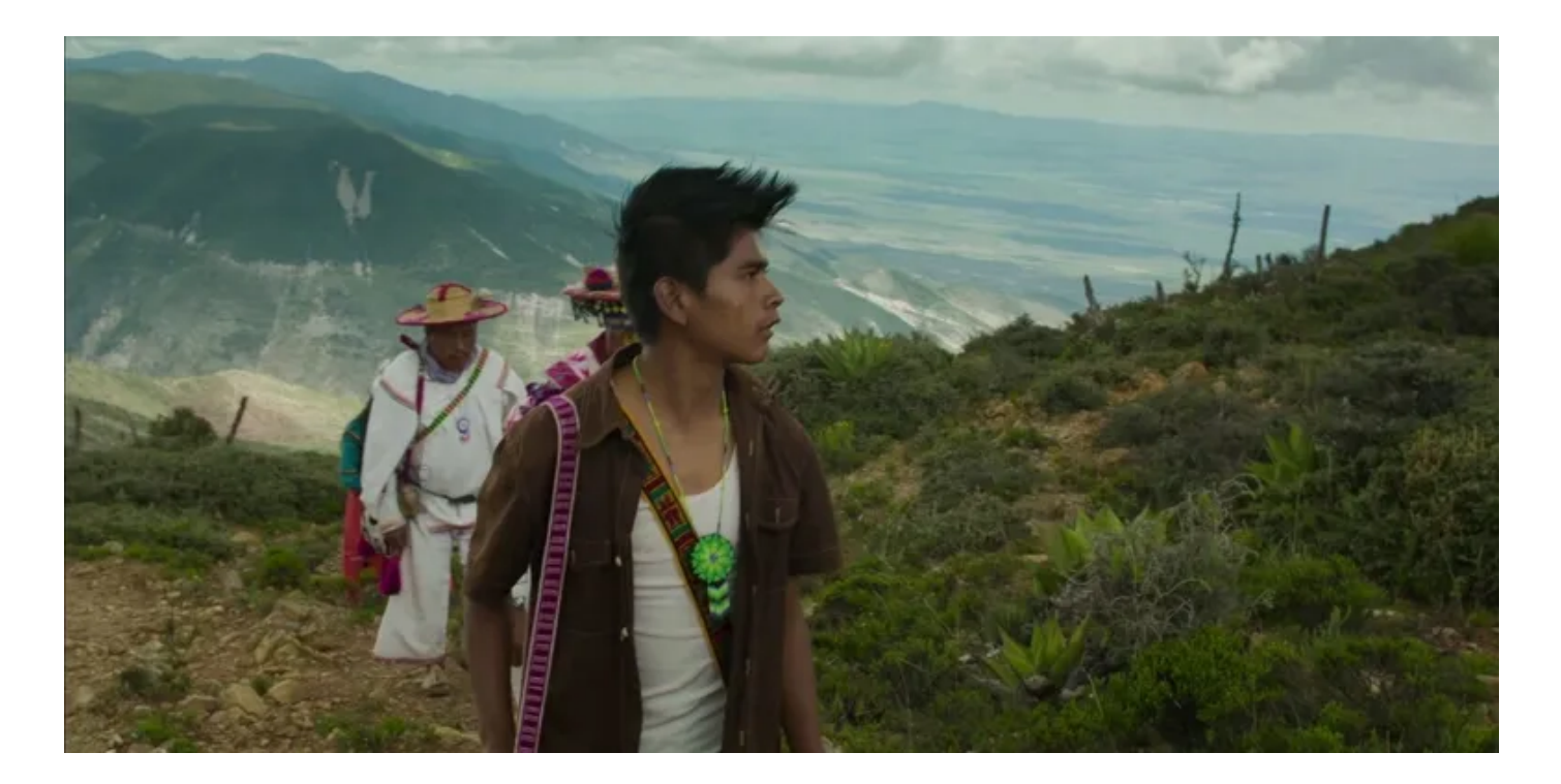
Sun., Aug. 11, 7:30pm-10:00pm @ Arts Court Theatre (3rd Floor, 2 Daly Ave.)

This film tells the story of Nieri, a young native Huichol whose dream is to travel with his band and play in a concert in Mexico City. But his father, a shaman Huichol, has other planes for him.