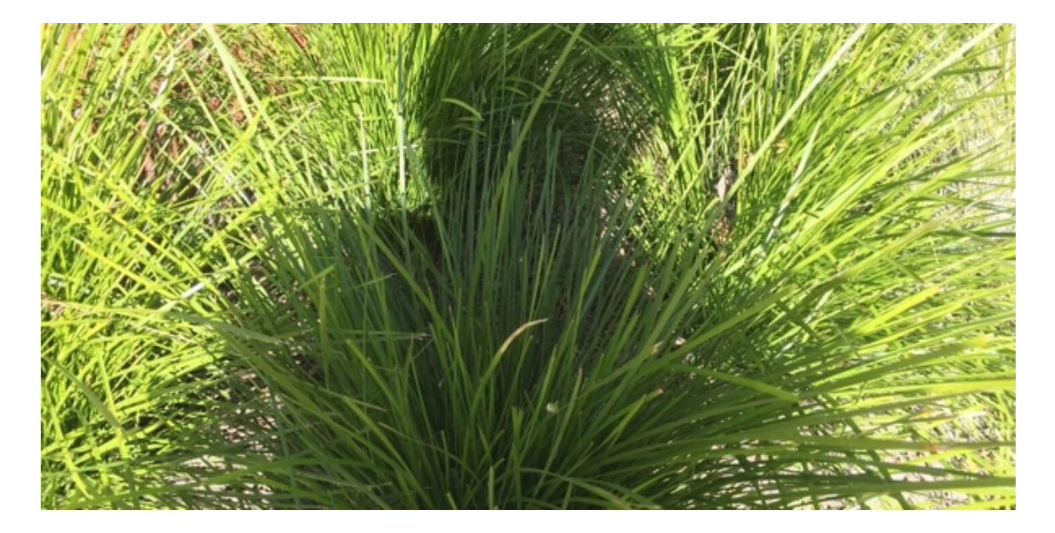
Jenny Fraser • 10 minutes • 2023 • Australia • English

'DURANGEN' means 'grow' or 'growing' in a number of dialects of the traditional Bundjalung language, and this documentary features six matriarchs speaking about their insider perspectives on plant art.