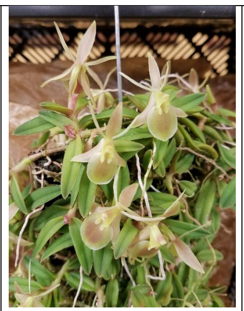
Epi gnomus Edgar Stehli