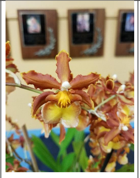
Onc. Catatante Barb Ford