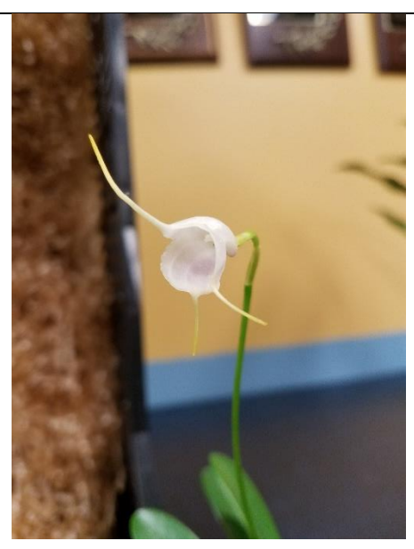
Masd infracta alba Jane Bush