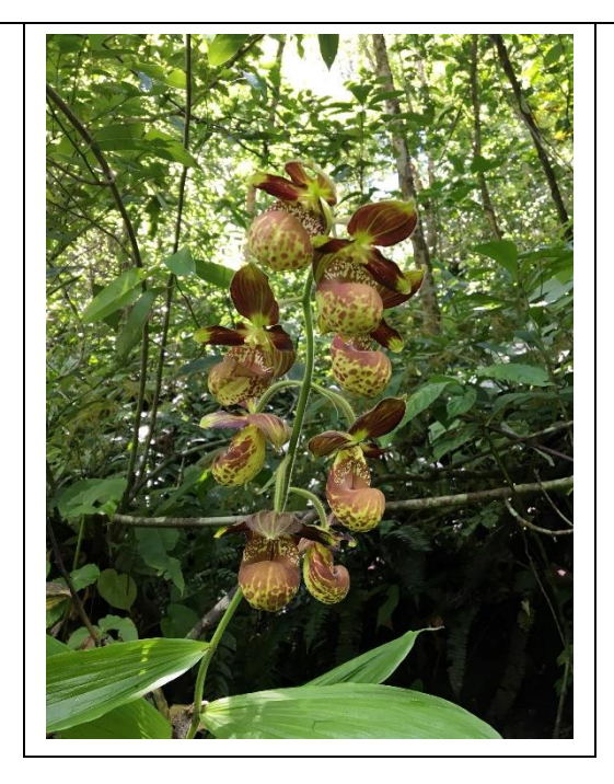
Photo of the Month: Cypripedium subtropicum in situ

Tim Choltco of Orchid Society of Western PA