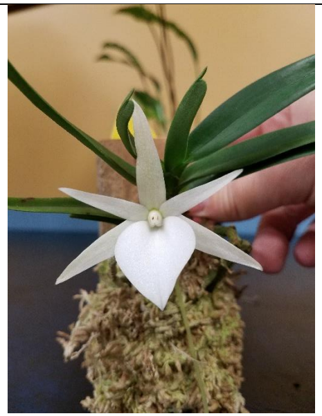
Angraecum rutenburgianum Edgar Stehli