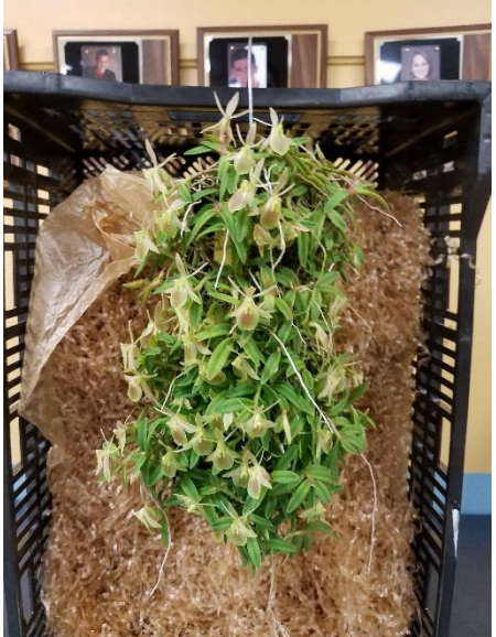
Epi gnomus Edgar Stehli