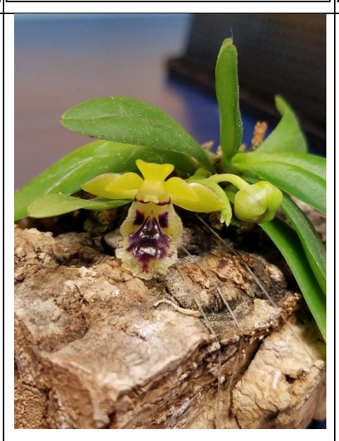
Haraella retrochilus