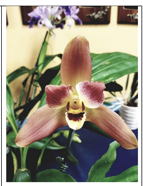
Lys Red Jewel Mary Bell