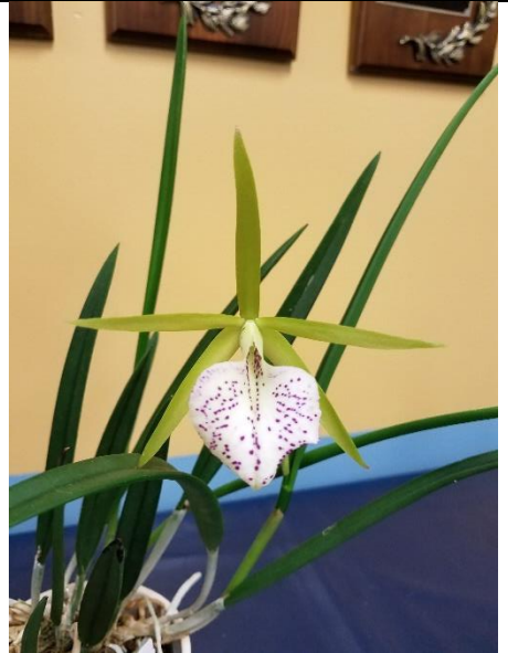
Bc. Binosa x Little Stars Claudia Englert