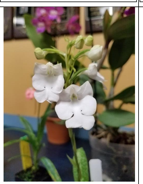
Hab carnea var alba Darlene Thompson