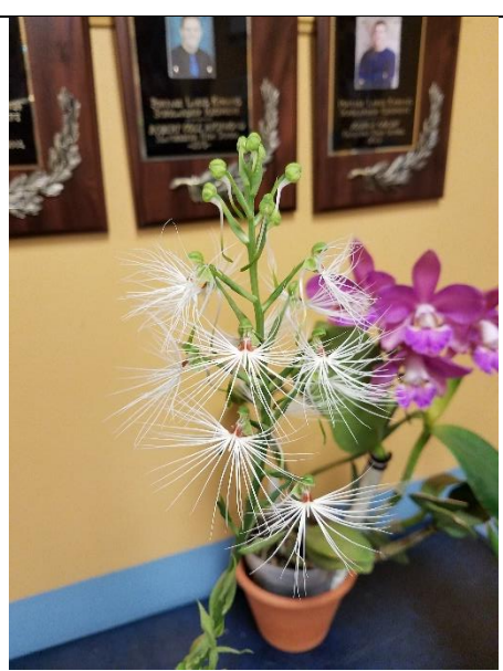
Habenaria medusae