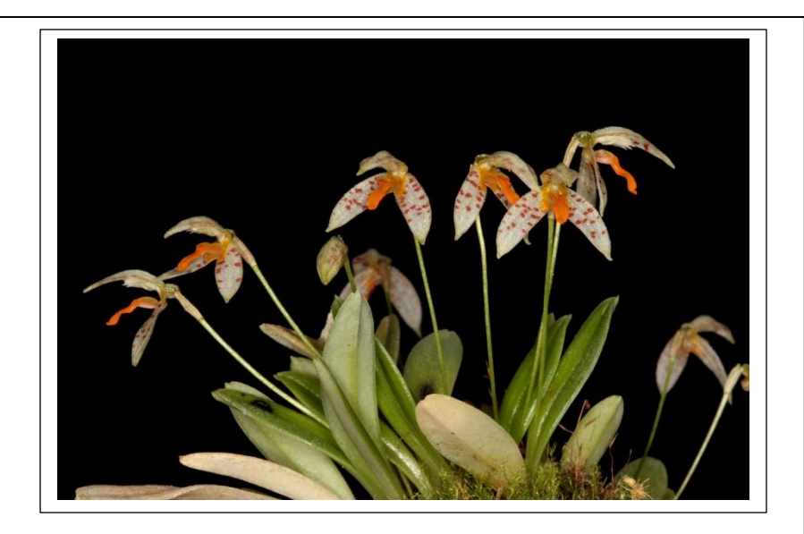
Photo of the Month: Masdevallia pleurothalloides, from the Panama cloud forests is a warm growing, high humidity miniature masdevallia