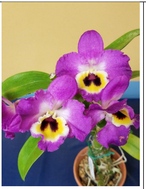
Den Red Emperor Bernadette Skalak